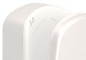
Two injection lines